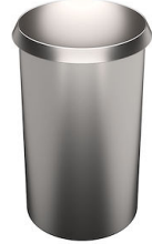
Bottle holder 1773 723