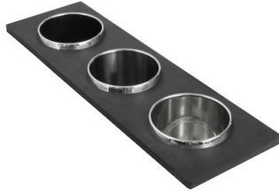
3 Bottles-holder set 8100 626